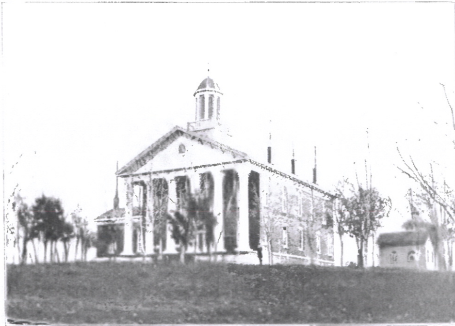
LEE COUNTY'S SECOND COURT HOUSE